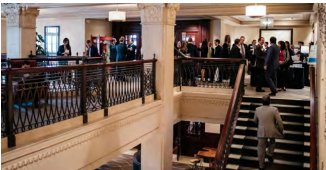
Guests mingle during a break after lunch. Policy Summit 2017 sold out with 150 guests participating in two days worth of legislative briefings, keynotes, panels and receptions.