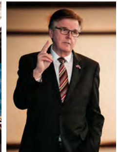
Lt. Governor Dan Patrick engages the audience during his address.