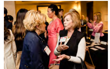
Former Texas State Senator Florence Shapiro (R) discussing education policy with Texas legislative staff prior to lunch.