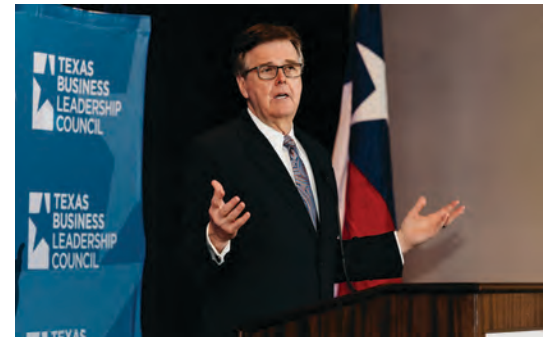
Lt. Governor Dan Patrick discussed priorities for the 86th legislative session during his luncheon keynote address.