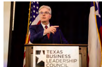
We were joined at lunch by Lt. Gov. Dan Patrick where he laid out his priorities for utilizing Texas’ budget surplus.