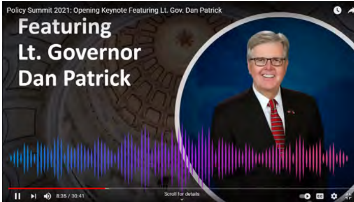
Lt. Governor Patrick discusses legislative priorities.