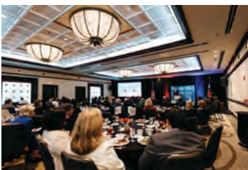
TBLC members, legislative staff, Texas business leaders and stakeholders filled the room for Policy Summit 2019.