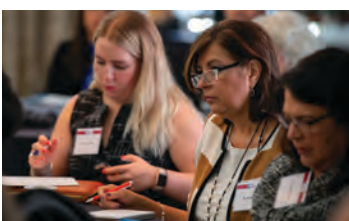
Policy Summit 2020 guests taking notes during the day's programming.