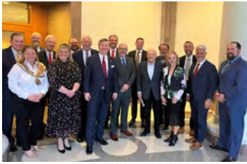
The day prior to Policy Summit, TBLC members had the opportunity to attend a meeting with Texas Legislators at the Capitol.