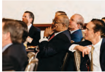
TBLC Members, public officials, and sponsors enjoying the day's events and speakers.