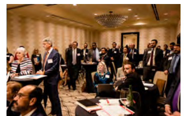
TBLC partnered with Educate Texas to host a reception where we learned more about THECB's updated Strategic Plan.