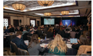
TBLC members, public officials and their staff, business leaders and stakeholders enjoying PS20.