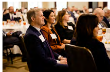
Senator Phil King (center) was one of the many public officials in attendance at Policy Summit 2023.