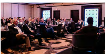
Thank you to our speakers, sponsors, and audience members for making PS18 a success.