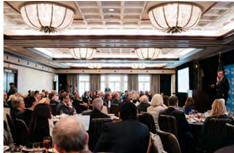
TBLC members, legislators, legislative staff, Texas business leaders and stakeholders packed the room for Texas Lt. Governor Dan Patrick's Keynote on school choice.