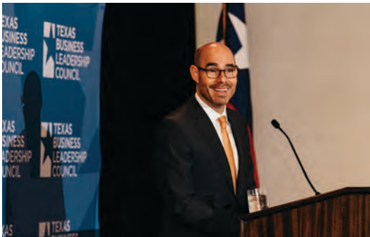
The day kicked off with a private legislative breakfast featuring Speaker of the House Dennis Bonnen as the keynote.