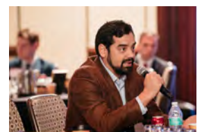
Audience members engaging with speakers during Q&A.