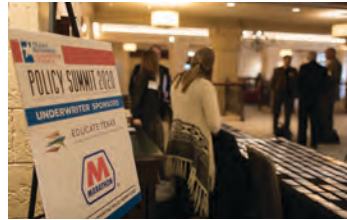
Thank you to PS20 underwriter sponsors Educate Texas and Marathon Petroleum.