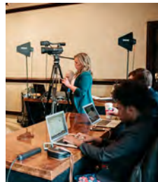
Capitol Press Corps wrapping up coverage of lunch.