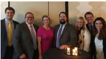
TBLC members, lege staff, and stakeholders visited with Sen. Dawn Buckingham at the Policy Summit 2018 reception.