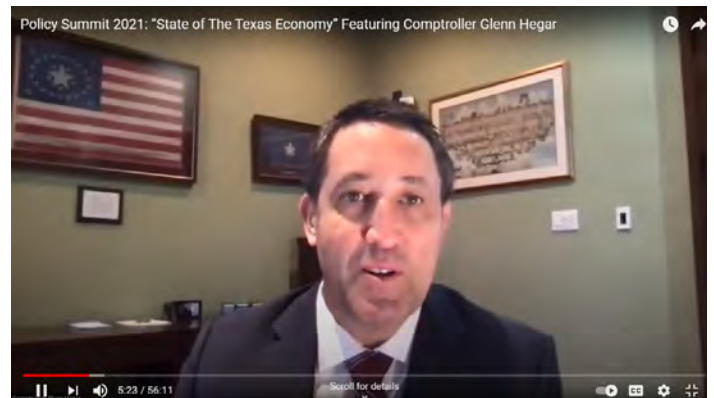
Comptroller Hegar discusses the "State of the Texas Economy."