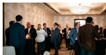
Guests, speakers, TBLC members, and lege during the post PS18 reception.