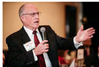
Sen. Bob Hall addressing the panelists during the question and answer portion of the Economic Incentives Panel.