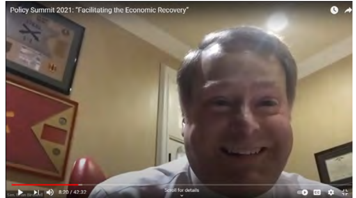
Sen. Brian Birdwell speaks on economic development.