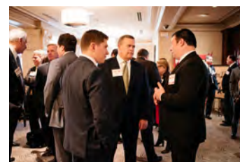
Policy Summit 2017 guests, sponsors, speakers, and TBLC members gather to socialize during one of the intermissions.