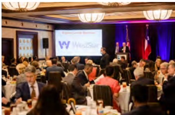
PS22 was a full house with TBLC members, public officials and staff, business leaders and stakeholders all in attendance.