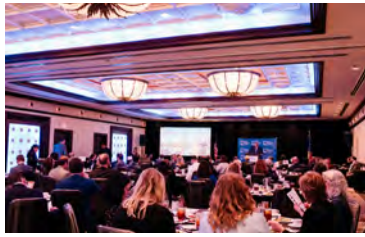
TBLC members, legislative staff, Texas business leaders and stakeholders filled the room for Policy Summit 2018.